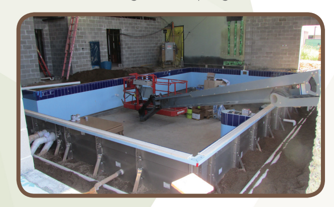
Please help us provide this valuable resource and improve the health of our community.